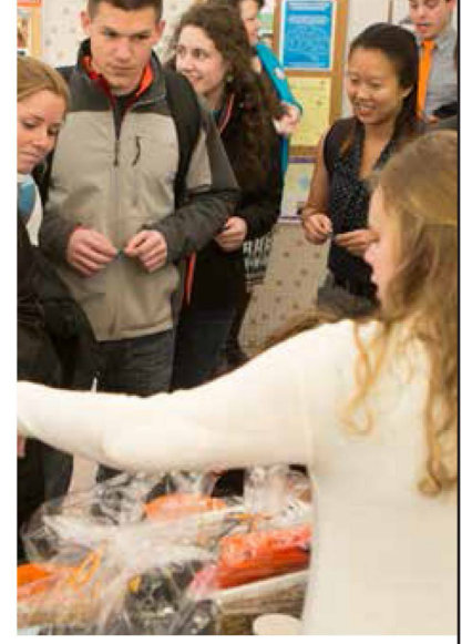
While ONU alumni and friends were busy donating online, ONU students enjoyed a number of Founder's Day-themed activities including a photo booth, prize raffle, ONU trivia and a special lunch at the dining hall.