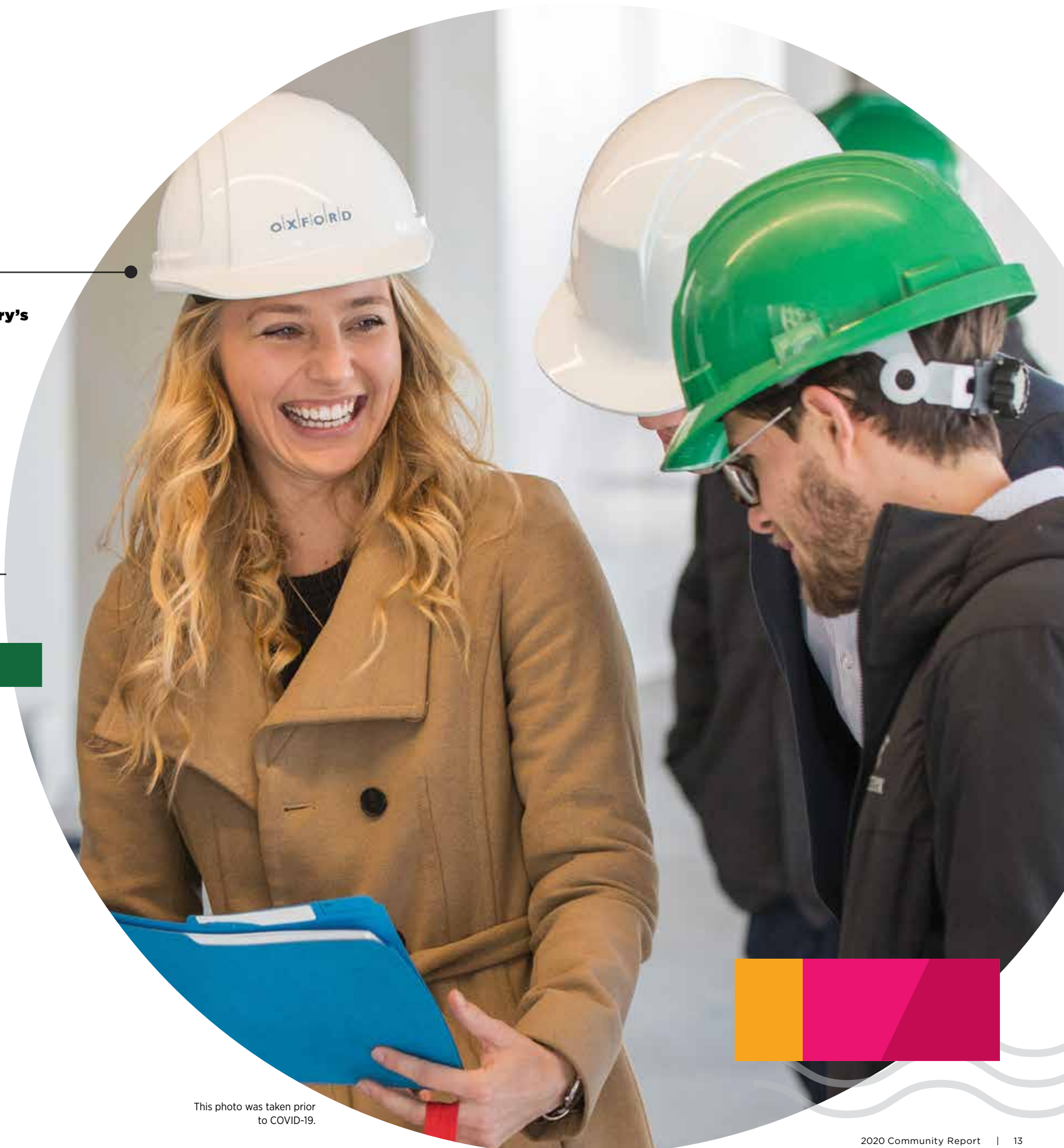
This photo was taken prior to COVID-19.