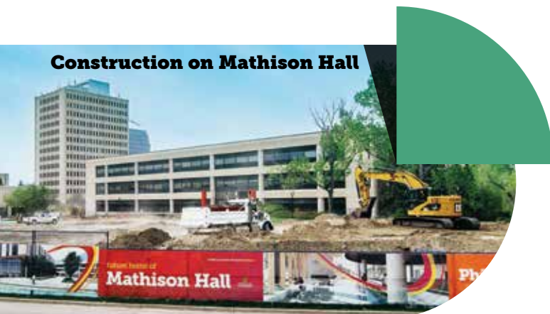
Construction on Mathison Hall