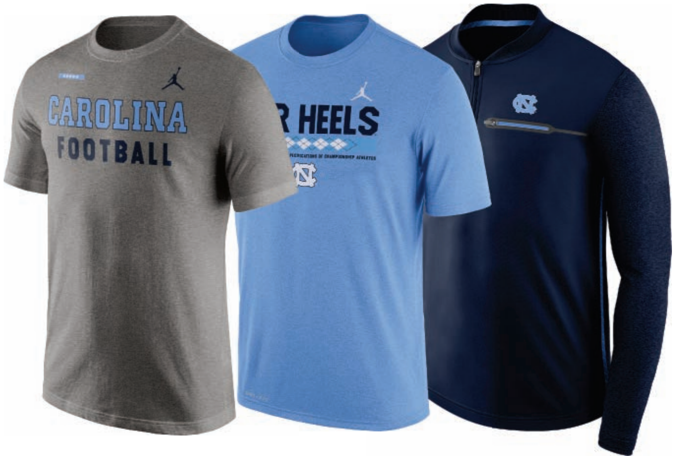
#92167 Nike Facility Football T $30.00

THE OFFICIAL MERCHANDISE PROVIDER OF THE GENERAL ALUMNI ASSOCIATION SINCE 1996