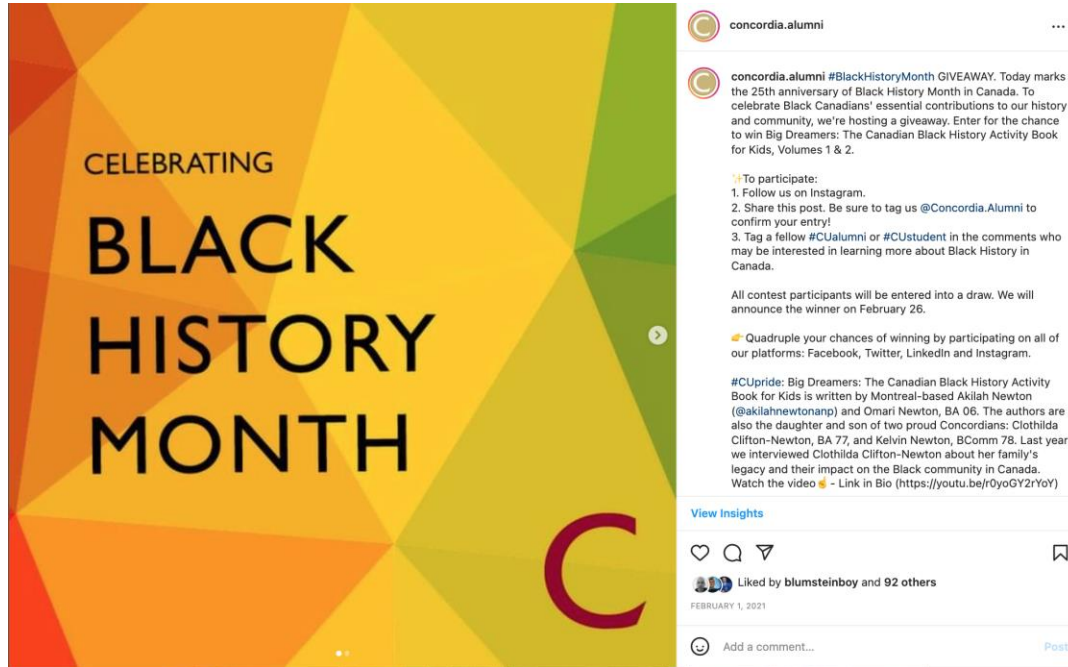
A social media contest

Contact Details: Melodie Le Siege, multimedia and social media producer, melodie.lesiege@concordia.ca ; 514-241-6299