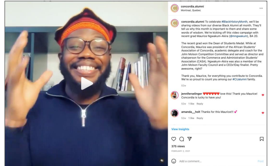
One of the 10 mini videos featuring prominent Black Concordia Alumni