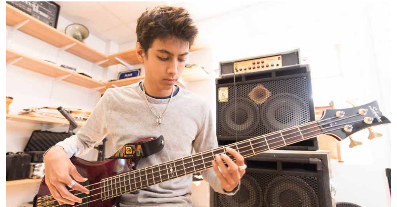
FIGURE 2: REHEARSAL AND RECORDING STUDIO