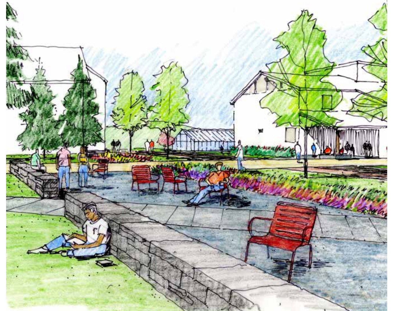
FIGURE 1: PATHWAYS