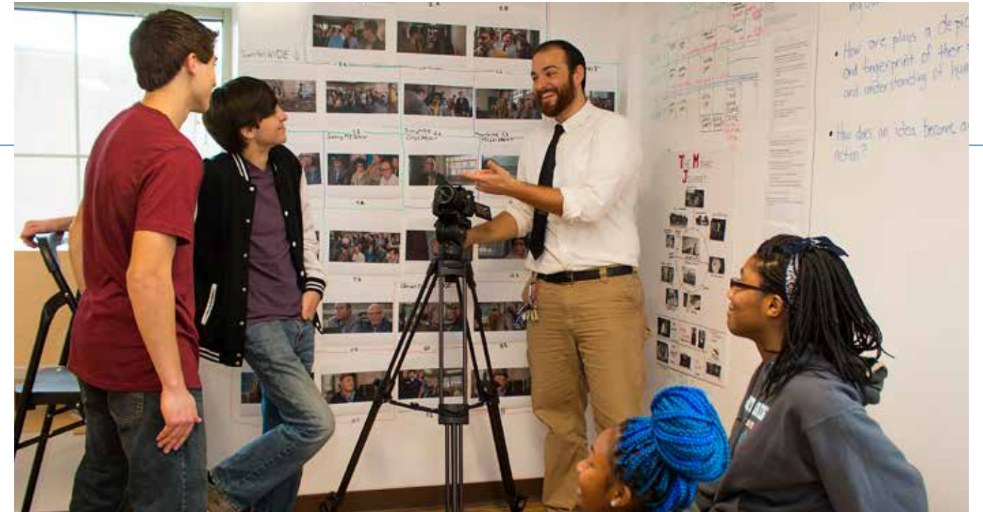
FIGURE 1: PERFORMING ARTS CENTER FILM LAB