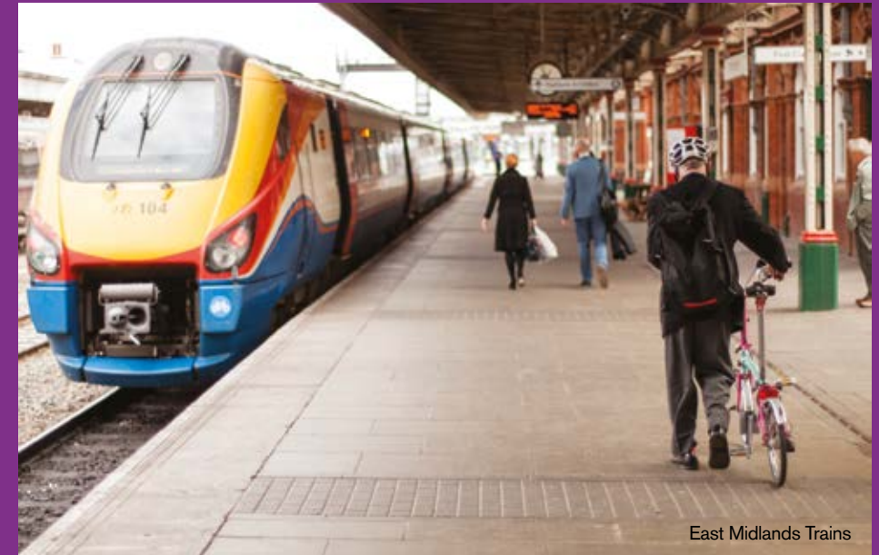
East Midlands Trains